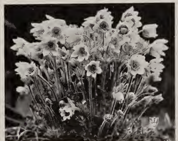
ANEMONE PULSATILLA or PASQUE FLOWER. The pasque flower. Lovely spring flower of fine blue color with reverse of petals covered by a fine silky floss; particularly charming; graceful cutleaf fern-like foliage. 25c each.